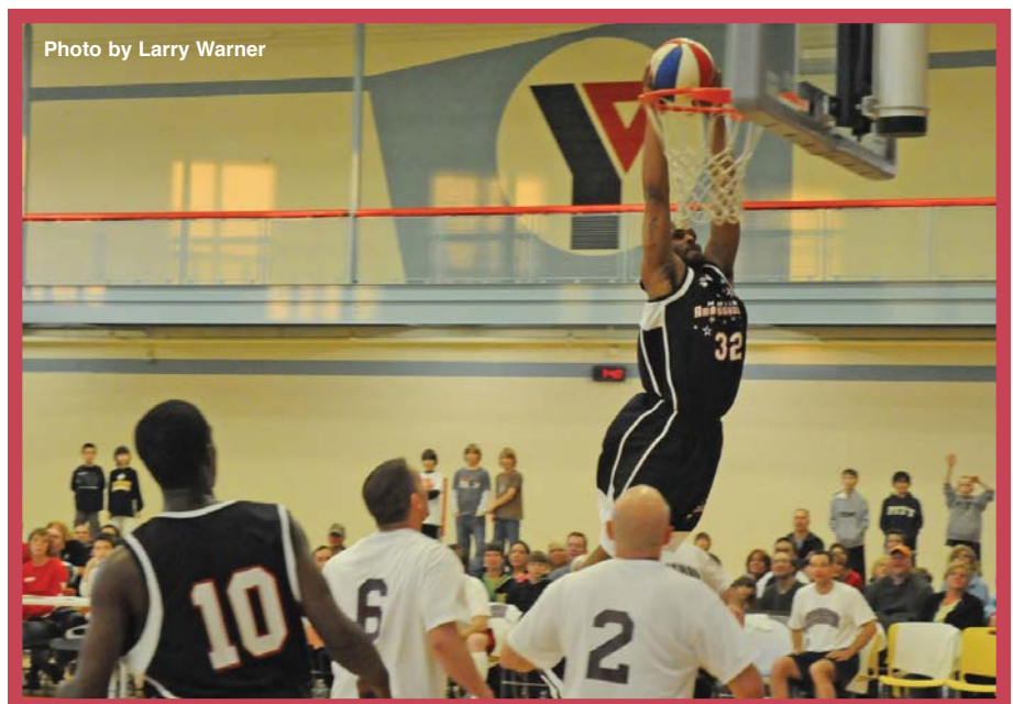
A Rotary fundraiser with the Harlem Ambassadors at Rose E. Schneider YMCA. The proceeds benefited a school in Patzun, Guatemala.